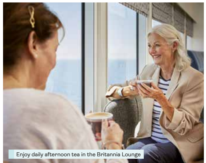
Enjoy daily afternoon tea in the Britannia Lounge

Additional cancellation cover: Where you have chosen to include the optional travel insurance you benefit from additional cancellation cover which allow you to cancel your cruise under a range of different circumstances and receive a full refund of all the money you have paid to us, less an administration of £100 per person. Please refer to our full booking conditions for details.