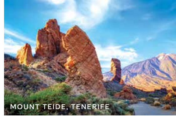
MOUNT TEIDE, TENERIFE