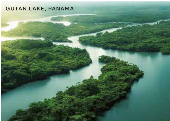
GUTAN LAKE, PANAMA