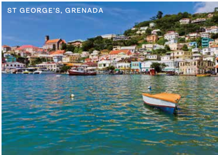
ST GEORGE'S, GRENADA