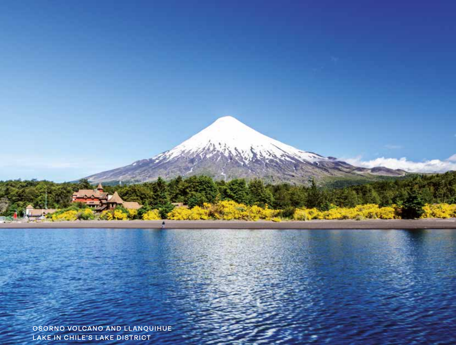
OSORNO VOLCANO AND LLANQUIHUE LAKE IN CHILE'S LAKE DISTRICT