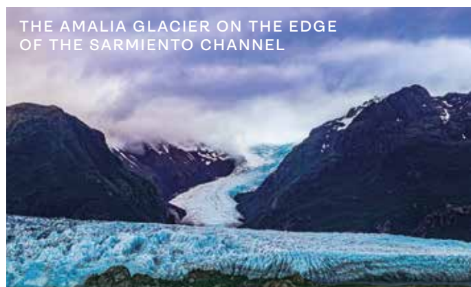
THE AMALIA GLACIER ON THE EDGE OF THE SARMIENTO CHANNEL